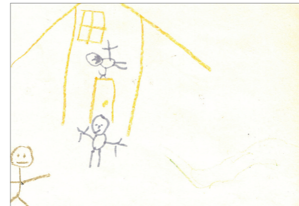
Age 5: "This is me at my old house. I am sleeping and then I leave & come here"