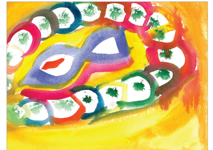
I Wish - Age 13: "I am in the middle of the ocean but I feel safe because others are protecting me. That is what I wish."

The number of women in the United States that will be killed by their husband or boyfriend each day.